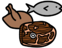
Eat Other Animals